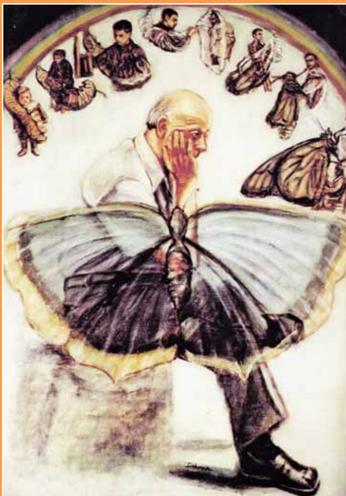
Nostalgia Oil on Canvas, 28" x 20"