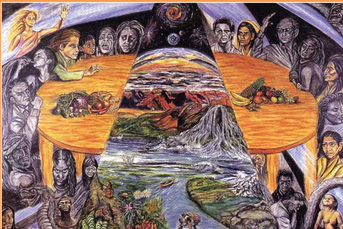
Look Inside Oil on Canvas, 53 1/4" x 78 1/2"