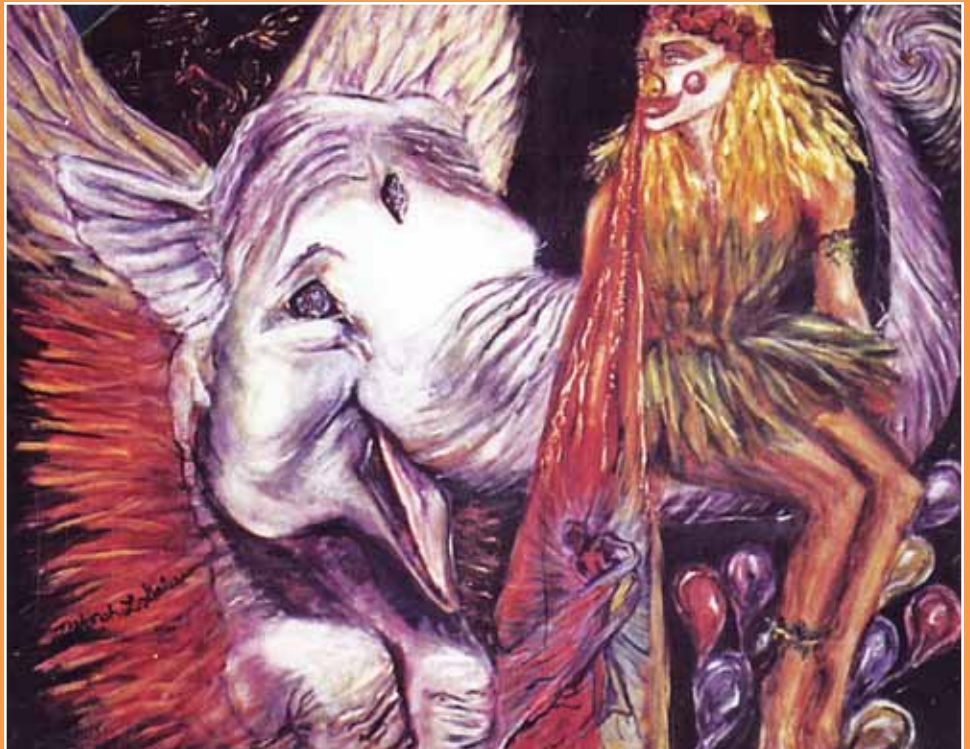
Laughing Your Way to Freedom Oil on Canvas, 51 1/4" x 63"